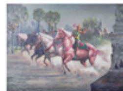
(U Hla Han) (102x77 inch)

Our customer can buy on website www.bahangallery.com