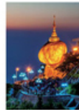
Golden Rock (Kye Soe) (18x24 inch)