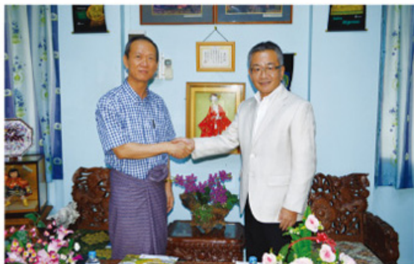
At the drawing room of Sakura Trade Center headquarter