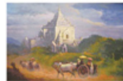
(U Thaug Lin) (36x24 inch)