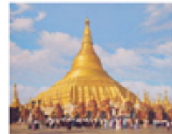
Born in Golden Land (MT.Oung) (48x60 inch)

Authentic artworks for your home or office