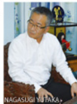
CEO, MYANMAR JAPON CO., LTD.